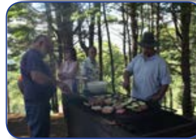
Food, Games, Music and Fellowship