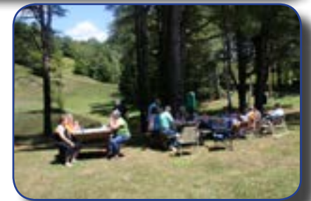
All are welcome!